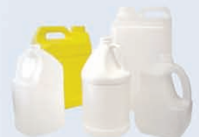
▶ Industrial and Household