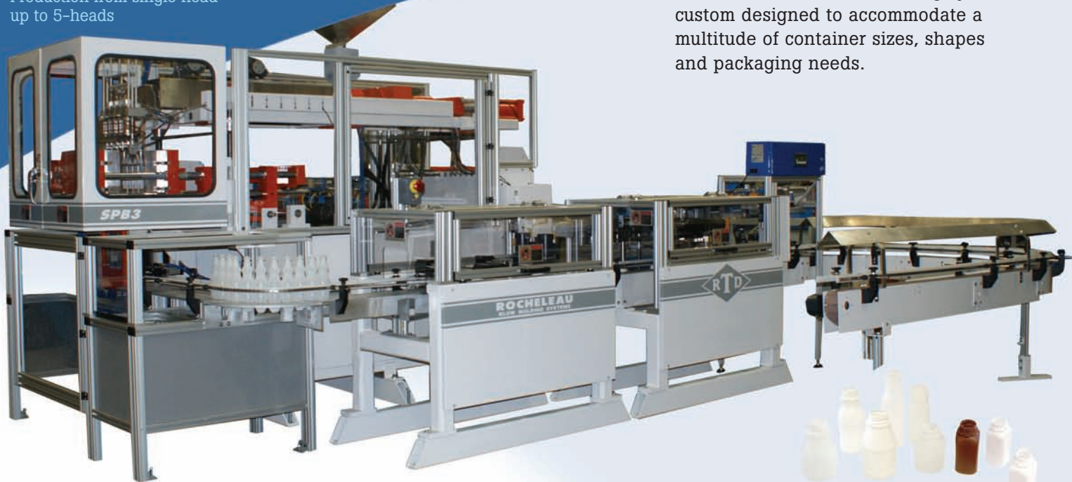
SPB-3/15 with Tail Puller and SPB/HT Spin Trim Take Away

Rocheleau offers blow molding systems custom designed to accommodate a multitude of container sizes, shapes and packaging needs.