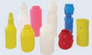
▶ Non-Handled Bottles