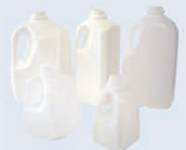
▶ Dairy Bottles