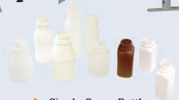
▶ Single Serve Bottles