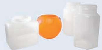
▶ Wide Mouth Jars